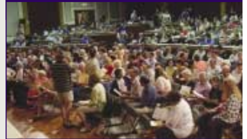
Anticipating the start of another wonderful Festival